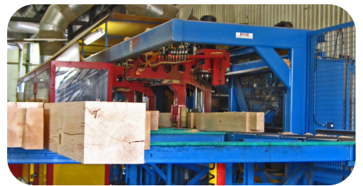
HUNDEGGER K2i FRAMING MACHINE